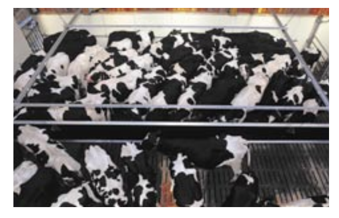
A few cows are left for milking from the first group. Behind the gate, a new group has entered the collecting yard.

New group of cows enter behind the gate.